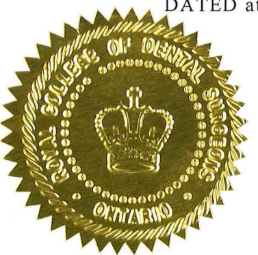
Royal College of Dental Surgeons of Ontario